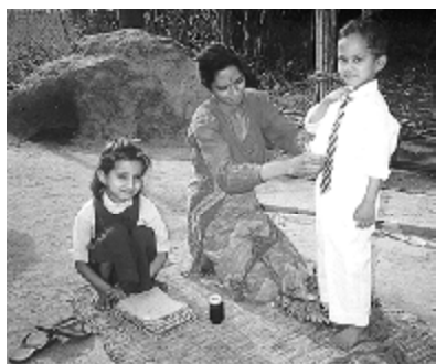
A mother in Chitwan prepares her children for school.