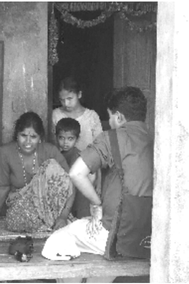
conducts an ethnographic interview