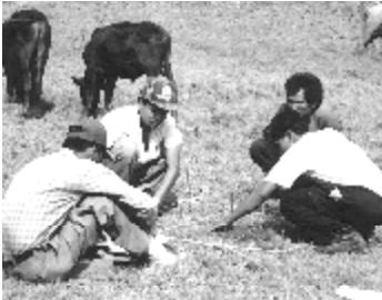
Flora biodiversity measured in the field.