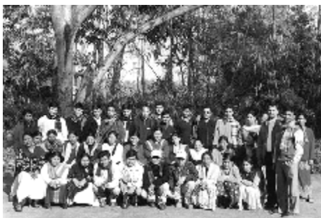
PERL field staff.

At the core of PERL's infrastructure are 46 highly qualified, multi-ethnic research staff members; 50% of whom are women. The research staff varies according to the number of projects in the field, but currently includes 28 survey