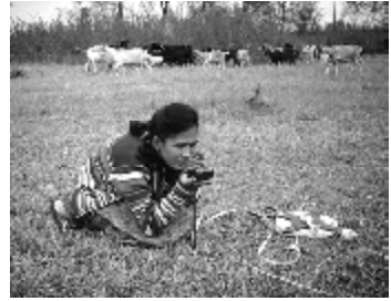
Land use mapping at study site.

reporting procedures, as well as data entry procedures and validation checks using programs written in BASIC and QBASIC. The land-use mapping teams gathered geographical data on 171 neighborhoods, including all boundaries on within-neighborhood land parcels, and data on specific point locations (e.g., hospitals, schools, and bus stops).