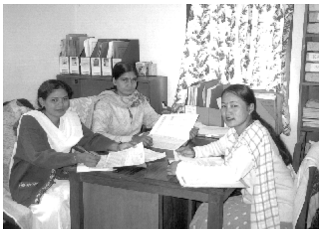
PERL study managers.