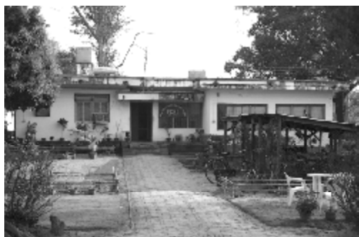
PERL office in Rampur, Chitwan.

These buildings have offices for project coordinators, faculty associates, research supervisors, and administrative personnel; a computer lab (with a backup energy supply, climate control, and power regulation equipment); space for transportation to facilitate field work and supervision; storage for incoming and outgoing questionnaires; a library; and a modestly furnished guest house for use by research scholars and visitors. In addition, PERL maintains a safe storage facility and communication center in Bharatpur, the nearby district headquarters. Five additional field offices are located throughout the current study areas, and are maintained for effective data collection.