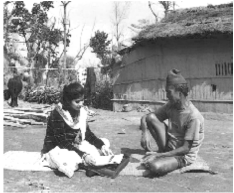
PERL interviewer conducts household interview.