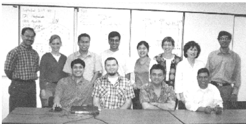
Data Users Workshop, May 2002