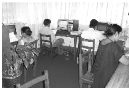
Survey data entry at PERL, Rampur.

PERL staff have completed several large-scale survey data collection projects. The first was a 60-minute household interview with 1,802 families, which was completed in 6 months with a 100% response rate. Second was a 70-minute personal interview with 5,271 adults (including a life history calendar), which was completed in 7 months with a 98% response rate. Third was a 20-minute seasonal agricultural practices survey administered to approximately 1,800 households every 4 months over a period of 3 years, which had less than 2% attrition of the eligible households. The fourth project is an ongoing registry of demographic events, which involves a monthly 10-minute interview with 2,200 households. This registry tracks the migration and demographic behavior (including contraceptive use, if appropriate) of about 15,000 individuals, following them as they move throughout Nepal. PERL staff have collected these interviews for 6 years with less than 3% attrition of the eligible individuals.