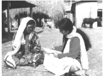
PERL interviewer collecting monthly household registry data.

PERL's quality control procedures meet or exceed U.S. survey research standards. PERL has a high supervisor-to-interviewer ratio (one supervisor for every six interviewers). Completed interviews are checked two or three times for errors and omissions before data entry. All data are entered twice, and data entry is performed in the field to allow for immediate follow-up on any discrepancies.