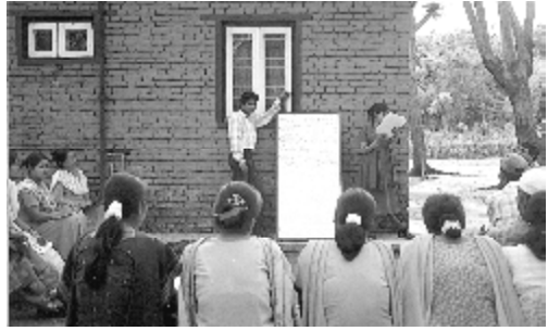
PERL interviewers get refresher training at Rampur.