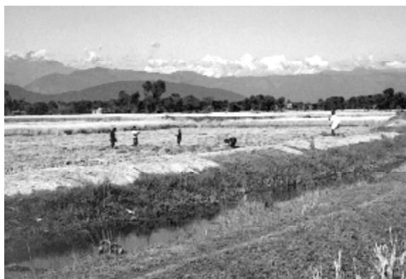
Rice harvesting in the PERL study site.